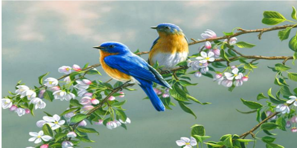
Nardin Park United Methodist Church