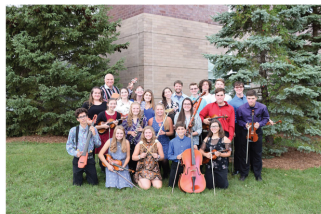
Celtic with a Kick!

Chelsea House Orchestra (CHO) provides a varied and colorful performance repertoire with the majority of the music derived from traditional Celtic sources. However, other folk music sources are used to provide students with an eclectic musical experience.