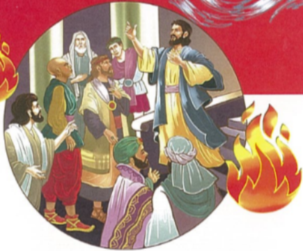
The people heard in their own languages.

Pentecost means fifty days after Passover