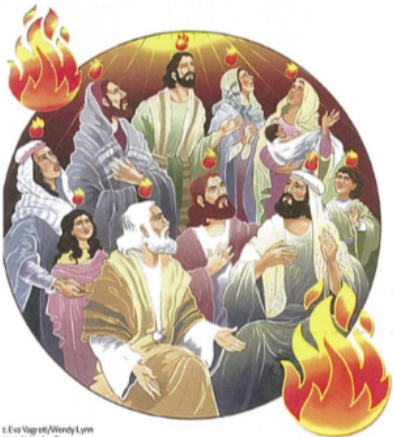
© Eva Vagstad/Wendy Lynn 2019 Abingdon Press

Pentecost means fifty days after Passover