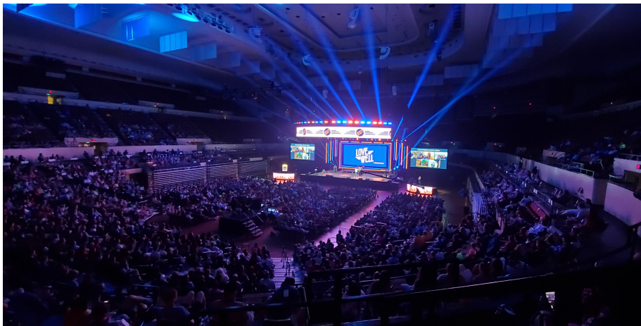
Kansas City Convention Center