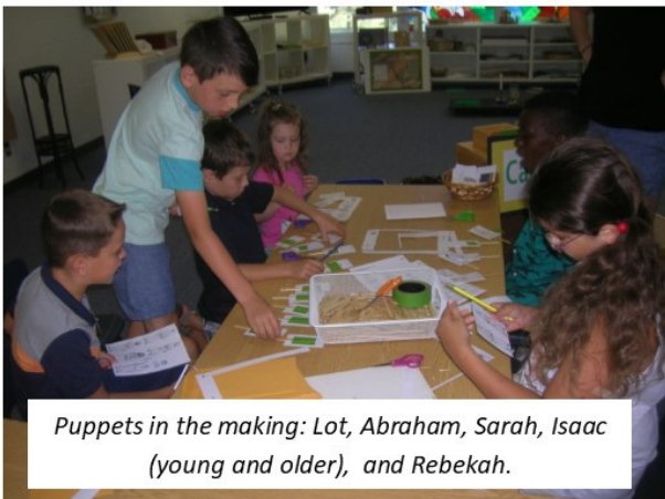
Puppets in the making: Lot, Abraham, Sarah, Isaac (young and older), and Rebekah.